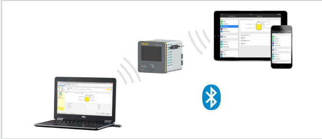
Wireless connection to smartphone/tablet/notebook

Operation is via a free app from the "Apple App Store", the "Google Play Store" or the "Baidu Store". Alternatively, adjustment can also be carried out via PACTware/DTM and a Windows PC.