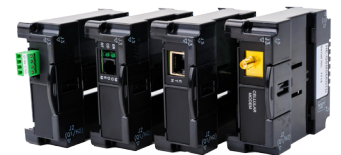
XL Series COM Options