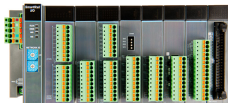
SmartRail Modular I/O