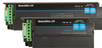
SmartStix Terminal Block I/O