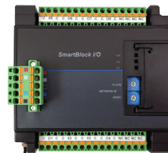
SmartBlock Specialty I/O