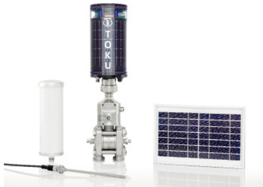
External Solar Panel and Antenna