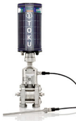
Standard Direct Mount